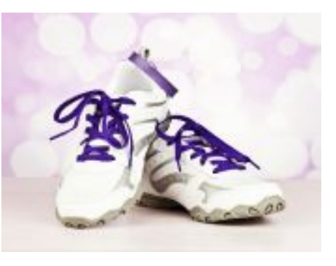
Together We Can Make a Difference!

together and put our best foot forward to make the difference happen!